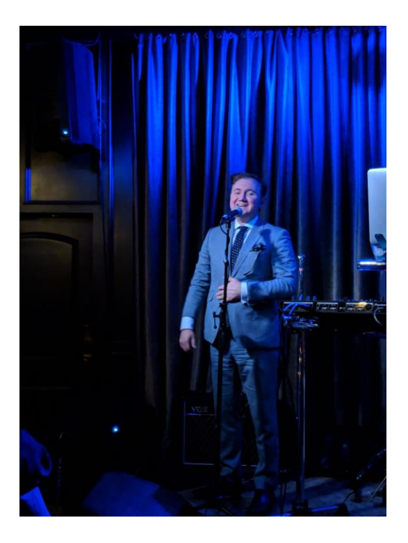
More Photos from MMF-US Networking Happy Hour during Grammys Week in Los Angeles