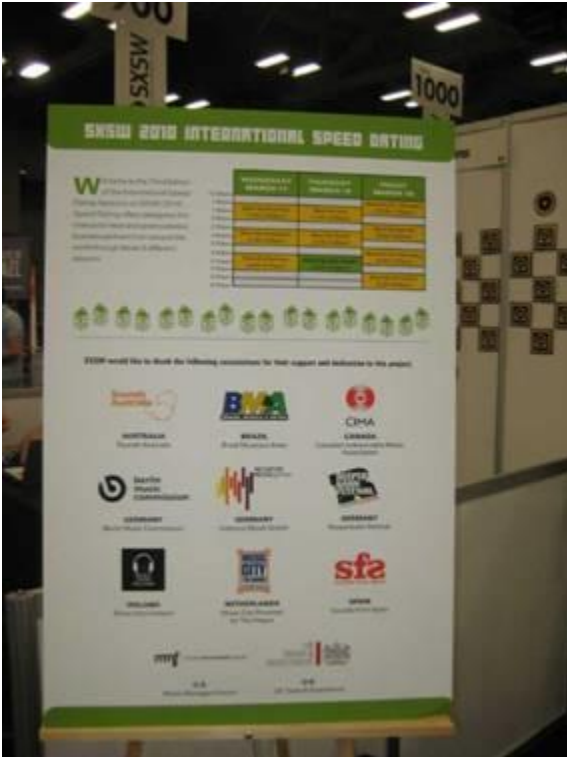
On Friday, March 19, 2010, Music Managers Forum-US supported SXSW in organizing ‘Meet the U.S. Managers’ for the International Speed Dating Session (ISDS) at the SXSW Media & Music Conference Trade Show Floor at the Austin Convention Center.